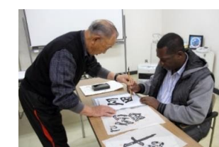
Black Ink Calligraphy